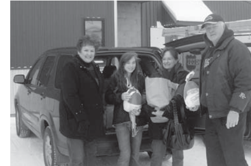
Volunteers distributed food baskets to home bound Senior Citizens